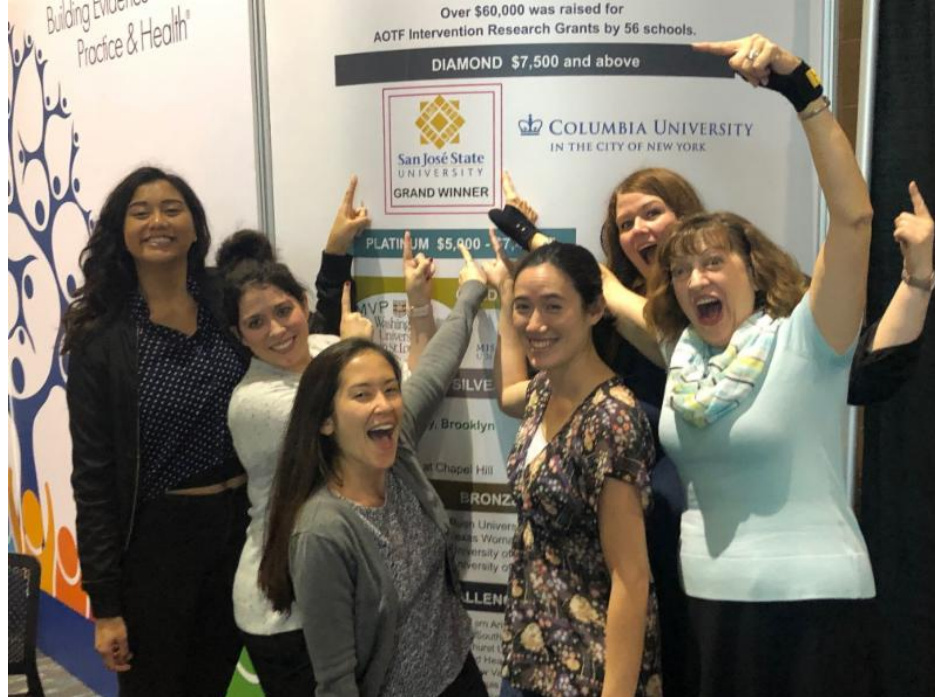
San Jose State University celebrates their 1st place finish.

Congratulations to the top five schools for their fundraising efforts in the 2018-2019 St. Catherine Challenge!