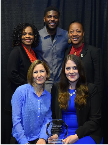
Rush to the Top winner -- Long Island University - Brooklyn.