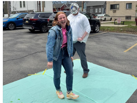
Eta Beta - Marquette University Held their pie-a-professor fundraiser.