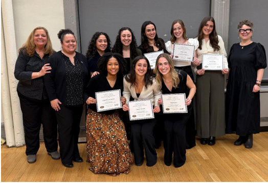
Epsilon Mu - New York University NYU holds their latest Induction.