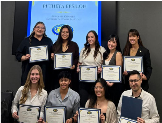
Alpha Phi - UNLV The chapter held its latest induction ceremony.