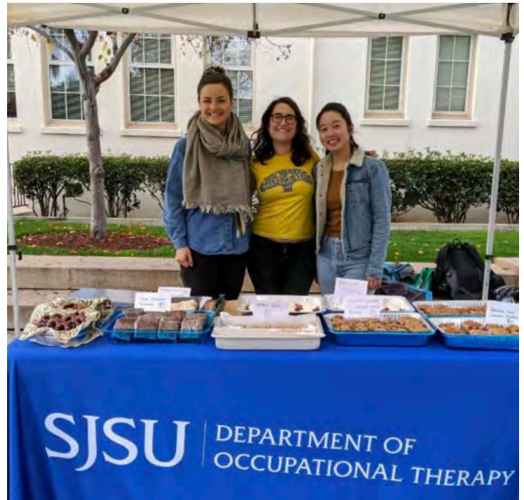
Top 2020 Fundraising School: San Jose State University

We are so proud of all our participating schools, the dedicated student leaders and faculty volunteers who made 2020 such a remarkable year. Thanks to their philanthropic efforts an OT researcher will be able to conduct new and novel research next year, adding more evidence to our field and improving the delivery of care.