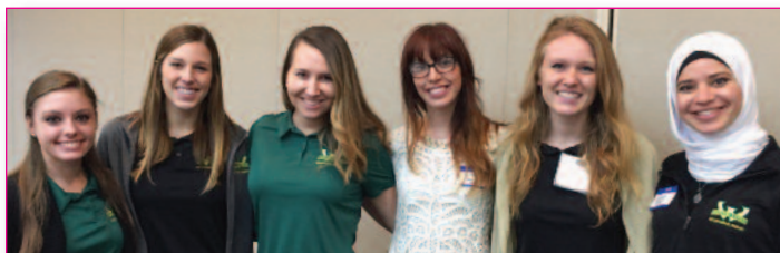
PTE Wayne State University students

The Pi Theta Epsilon President's Award recognizing outstanding scholarly activity was jointly presented to the University of North Dakota and University of Mary for their coordination of the 9th annual North Dakota Occupational Therapy Student Conference with over 100 students in attendance.