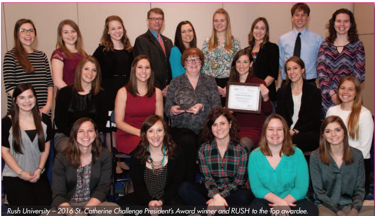
Rush University – 2016 St. Catherine Challenge President's Award winner and RUSH to the Top awardee.