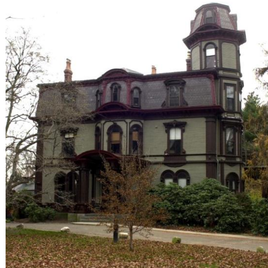
Adams Nervine Asylum