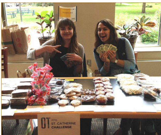
Bake sales and fundraisers throughout the year helped schools reach their goal.