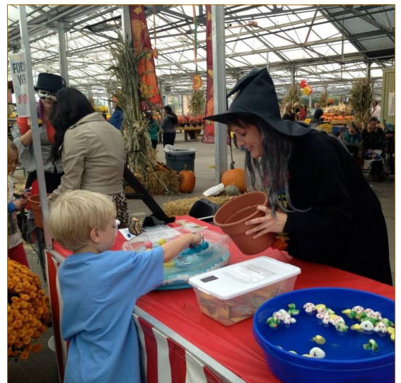
St. Catherine U. students participated in their Fall Festival to raise funds with games